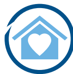
Providers & Payers