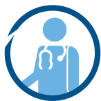
Physicians & Staff

the role-based care coordination platform that connects your residents, their family members and everyone on their entire healthcare team – for better outcomes across the continuum of care.