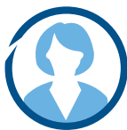
Patients & Residents