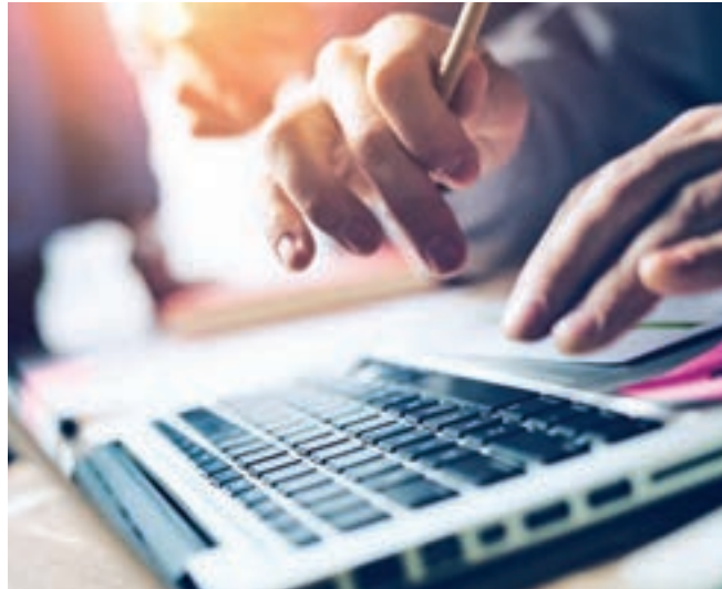
Managers now have more digital tool available for employee management.

D'Angelo says, is having a multi-dimensional platform dedicated to healthcare functions that offers a holistic view of the enterprise.