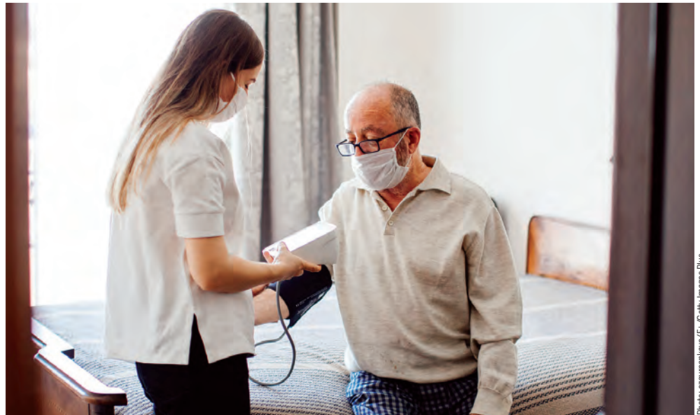
The COVID-19 pandemic could lead to more skilled nursing facilities delivering on-site primary care and managing a patient's underlying chronic health conditions.

Expenses soared for many things — from personal protective equipment and test costs to overtime and agency help. Mace believes some of the losses will be offset from deferred capital expenditures and postponed renovation projects. Some operators also tapped into the Paycheck